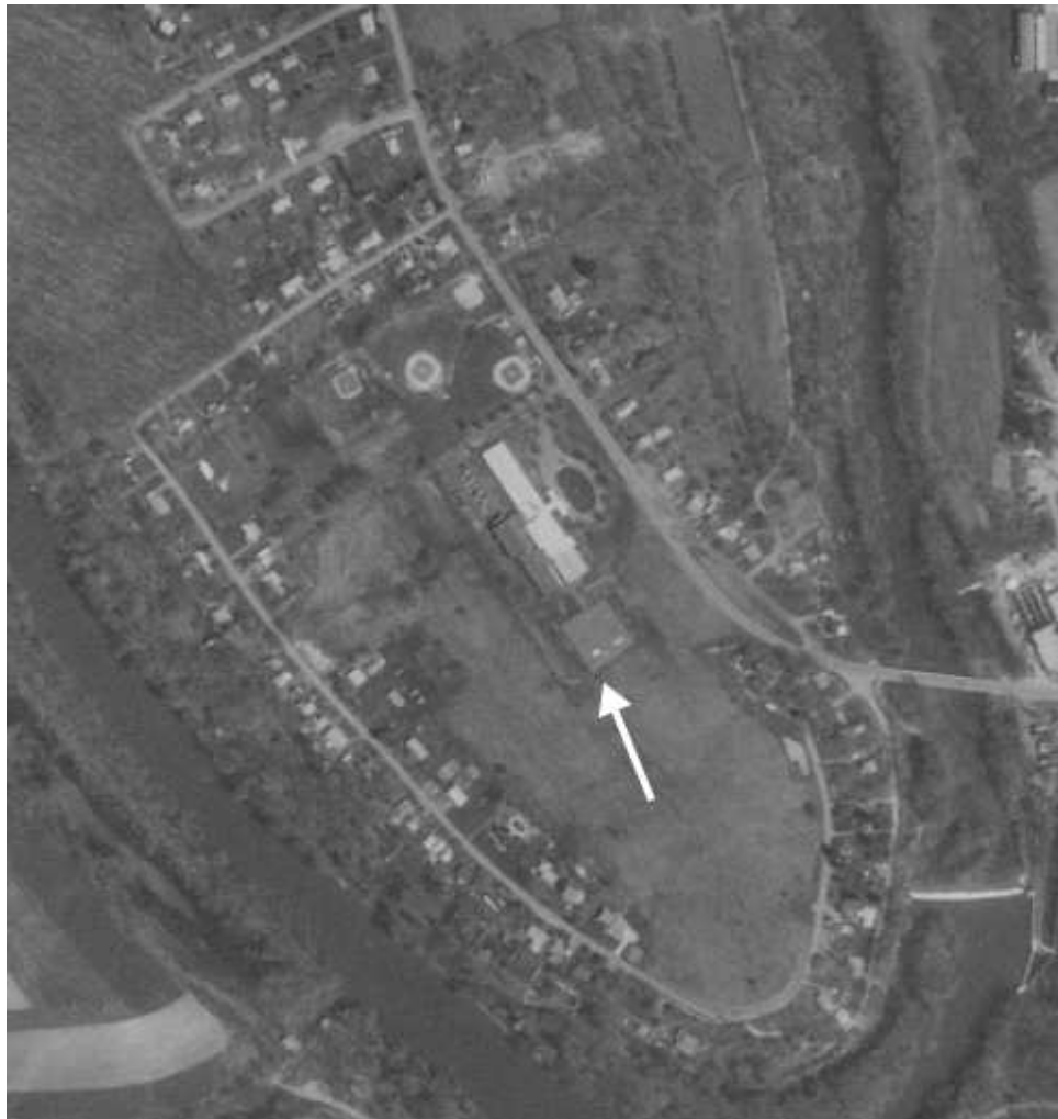
Aerial View of Crestview Elementary School

1994 Carlisle, PA Quadrangle . 7.5 minute series. Topography compiled b 1994. Planimetry derived from imagery taken 1994 and other sources. Denver, CO.